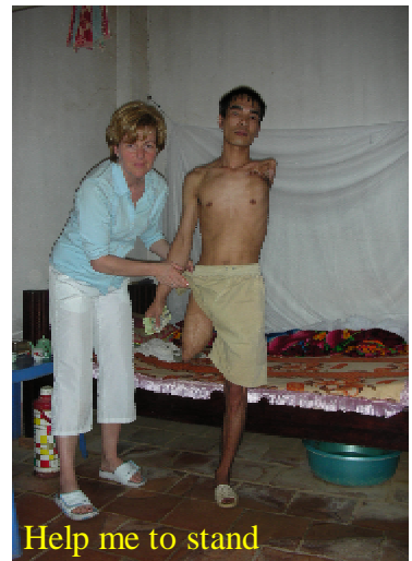
Help me to stand

Heart Surgery Children in Hue Spon- sored by Medical Aid Project