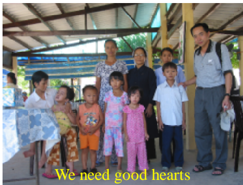
We need good hearts

Buon Me Thuot's Orphan and Blind Children