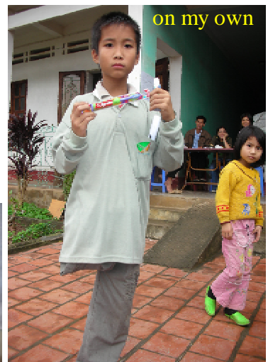
on my own