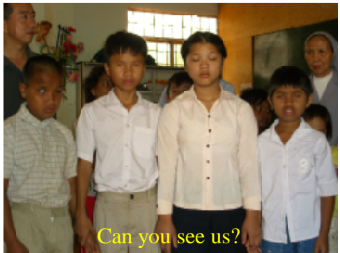
Can you see us?

100% of your contribution directly funds our Medical Aid Projects Your contributions are tax deductible according to IRS rules